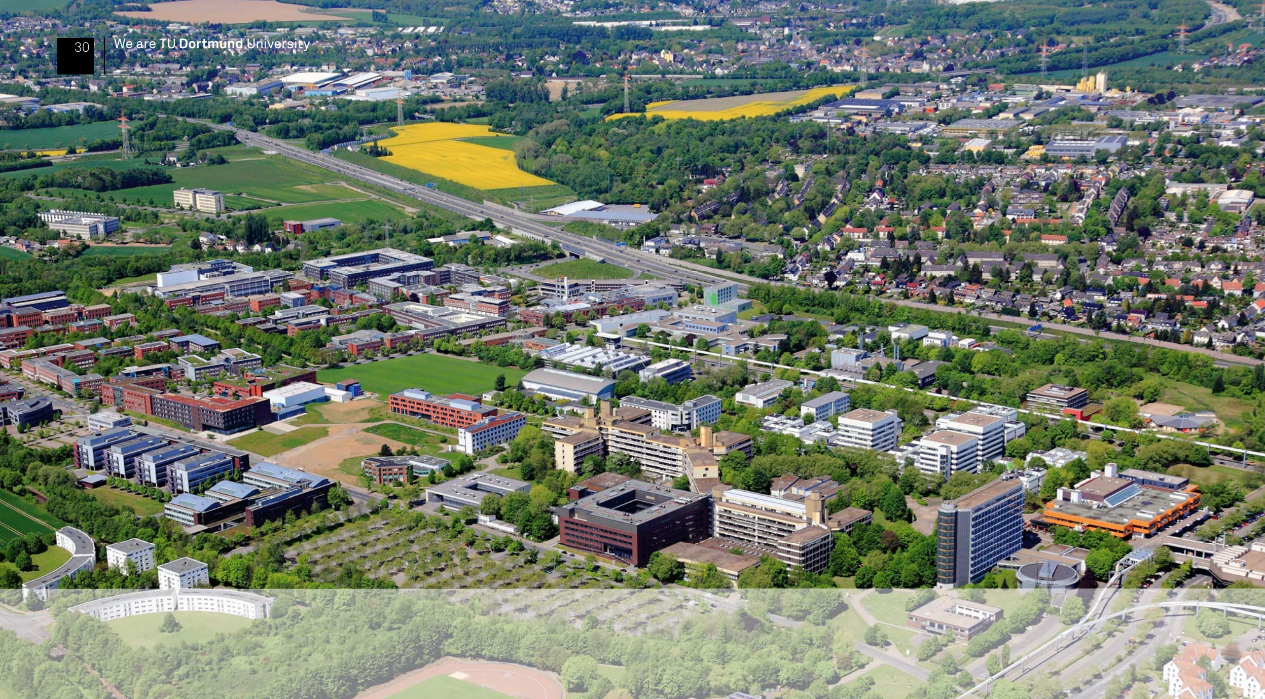
Aerial photograph 2015

Europe's largest technology park adjacent to a university