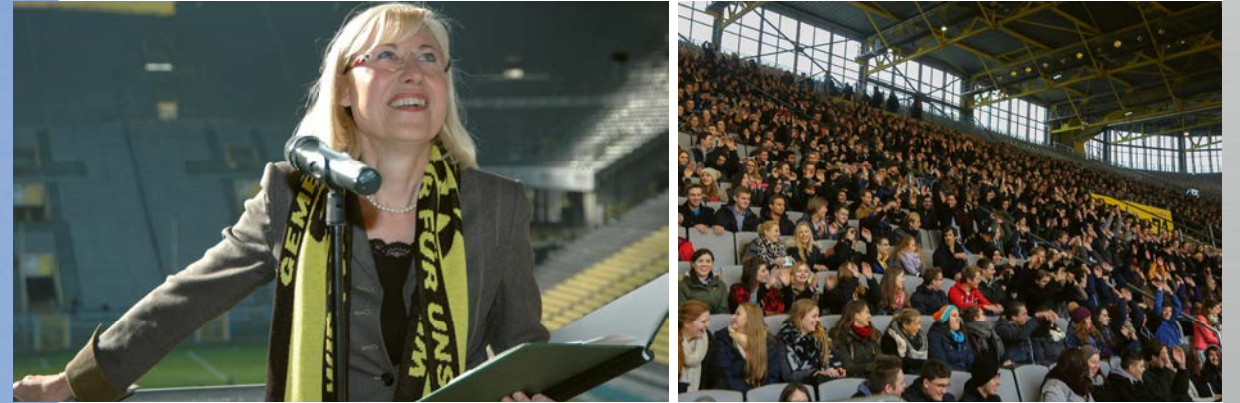
Welcome event for first-semester students in the stadium of the SIGNAL IDUNA PARK

master plan 'Science City Dortmund', which was adopted in 2013, further strengthens this profile and the international