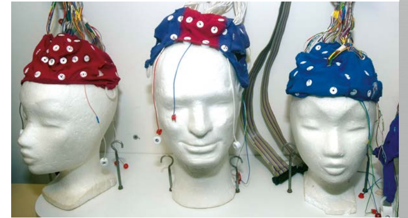
Brain wave measurement, IfADo

Three other institutes are affiliated with the university: the Institute of Gerontology, the Research Institute for Technology and Disability, and the German Institute for Civic Art. Together with the University of Applied Sciences and Arts and TU Dortmund University, most institutes are members of windo e.V., an association of science institutions in Dortmund.