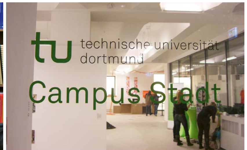
Campus City in Dortmunder U