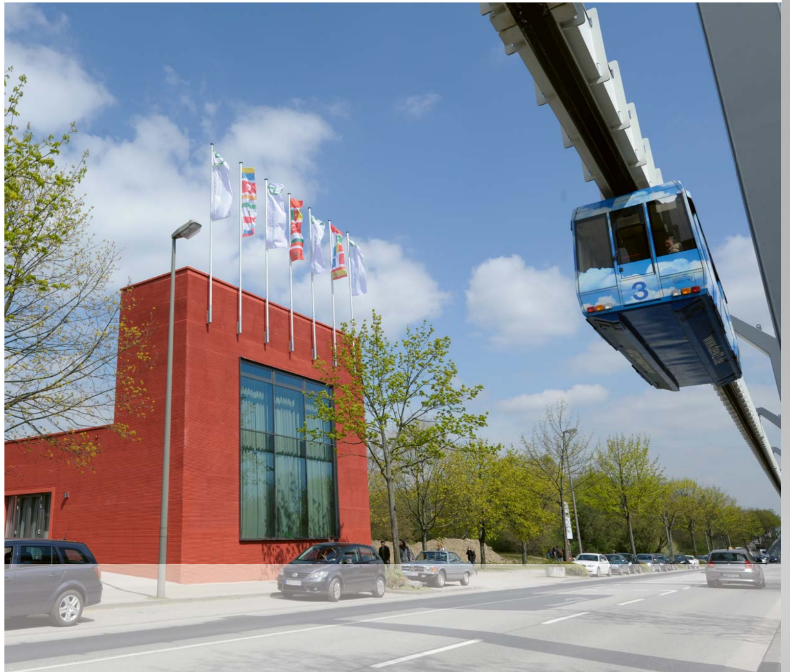
International Meeting Center IBZ